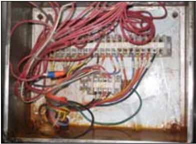
Water accumulation in electrical cabinet