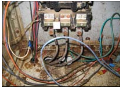
Corrosion leads to premature component failure